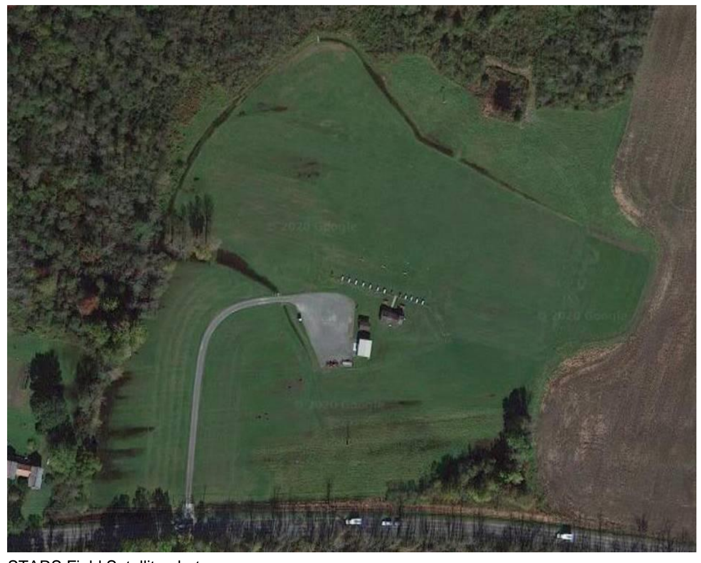
STARS Field Satellite photo